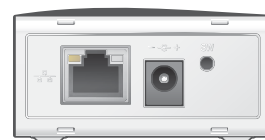
Gigabit Ethernet connection

2 USB ports – one with 4 times the current supply provided by a conventional USB port (up to 2000 mA); using an optional USB hub, a maximum of 15 USB connections are possible